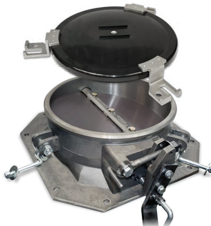
ABS Injection Molded Plastic cover